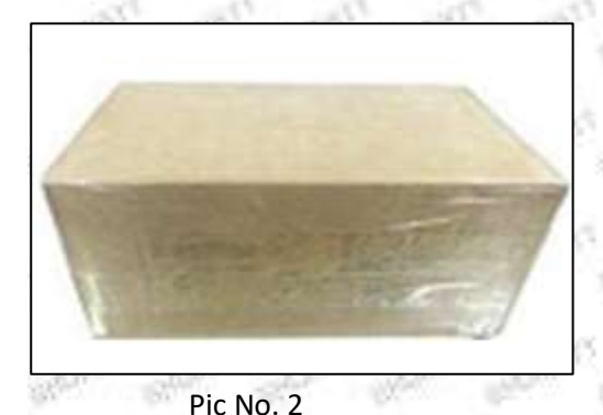
Domestic express packaging: Wrapped with Transparent tape

Minors are prohibited from using transparent tape, yellow tape, black wrapping protective film, and white wrapping protective film to avoid personal injury.